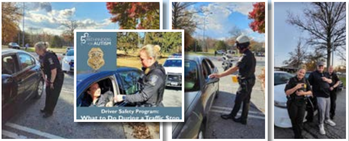
MCPD partners with Pathfinders for Autism in our "Mock Traffic Stop" webinar and in person traffic stops. Click here for upcoming dates https://pathfindersforautism.org/