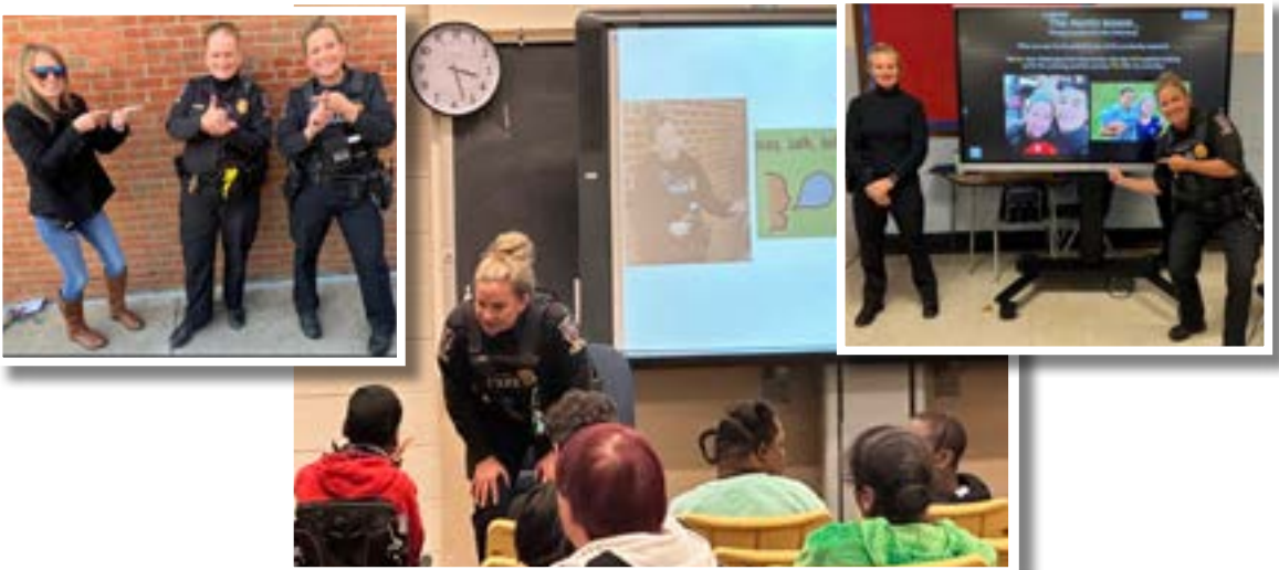
Officers from the MCPD Autism/IDD Unit presenting to schools on community safety.