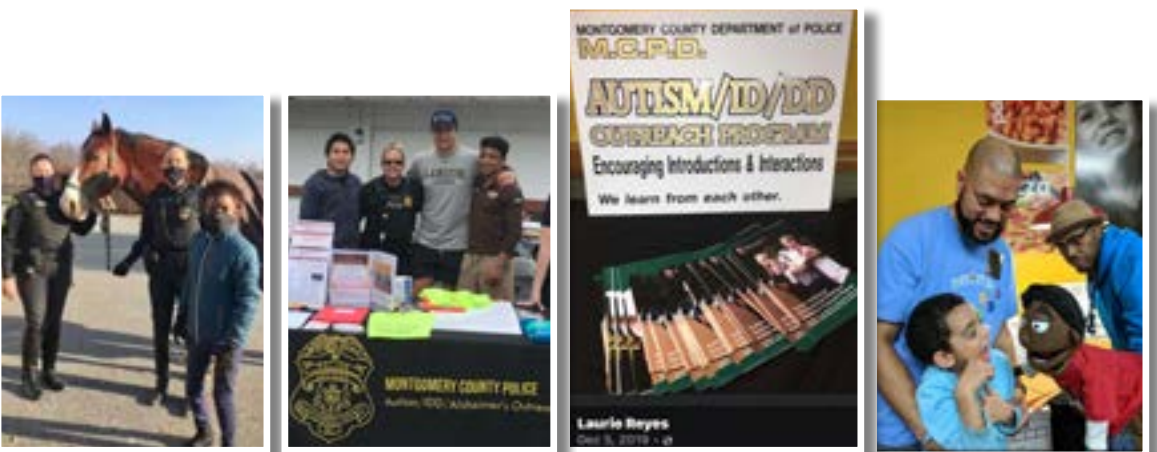
Officers from the MCPD Autism/IDD Unit and our partnering agencies providing community outreach.