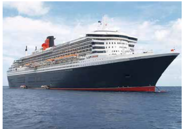
In October we took our longest trip yet, a transatlantic voyage aboard the Queen Mary 2.

Many volunteers contribute countless hours to assist with the programs at the Center. Our special thanks to the Village Council, our committees (including the Program Advisory Committee, whose valuable input is always appreciated), volunteers, and staff for their dedicated efforts throughout the year.