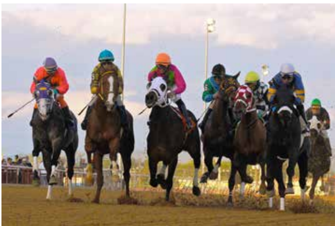
In May we were off to the races at Charles Town.

The Village Center continued to offer a variety of programs for children, ranging from art to storytelling to splash parties in the park. Among the highlights was a week-long summer art camp for kids. In the fall, Village children enjoyed a hayride, fed farm animals, and picked pumpkins. We also continued our weekly drop-in Village Playtime.