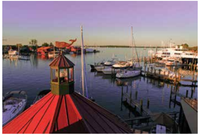
In July we visited St. Michaels on the Eastern Shore.

Throughout the year, children from toddlers to teens enjoyed musical programs ranging from Hawaiian music and dance to Mariachis de los Compadres to sea shanties by the Washington Revels. Family-friendly movies ranging from Wreck It Ralph to Diary of a Wimpy Kid , had special appeal for children. In 2014, look for chances to take classes with your kids, as well as an array of music and cultural events for children.